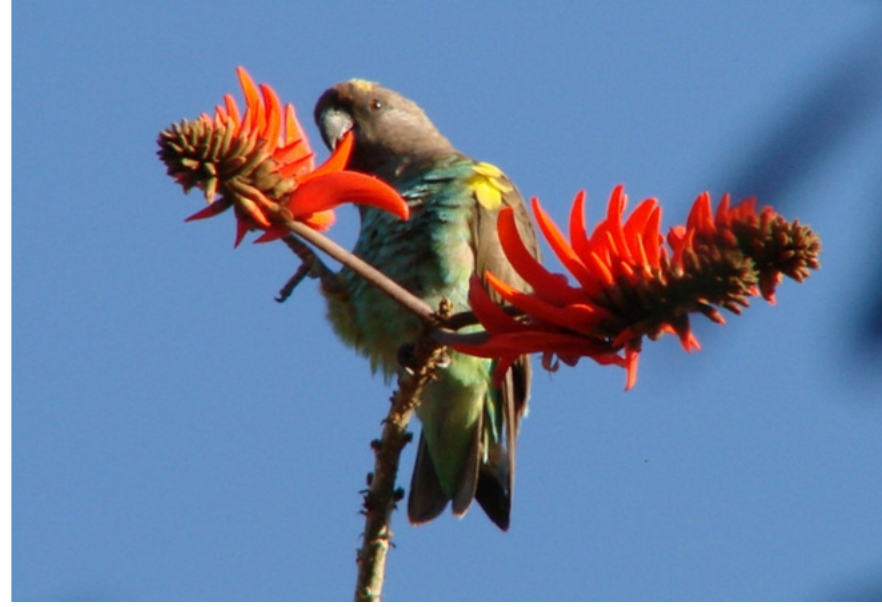
Meyer's Parrot eating flowers of Erythrina caffra

Contributions for The Babbler 121 December 2014 /January2015 may be sent to the editor anytime between now and 14<sup>th</sup> November 2014.